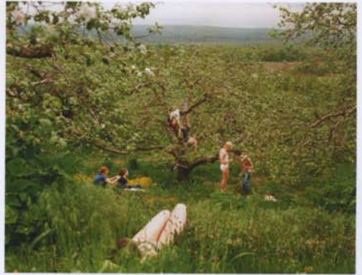
L. Anthony Goicolea, Ash Wednesday , 2001; color photograph: 40 x 80 inches; collection of Stéphane Janssen, Arizona